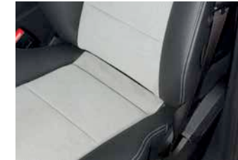
Car seats (Alcantara)