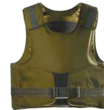
Protective clothing (Kevlar)