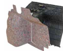
Insulating materials for cars