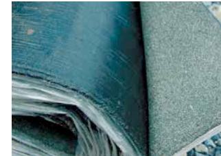
Bitumen-coated roofing felt